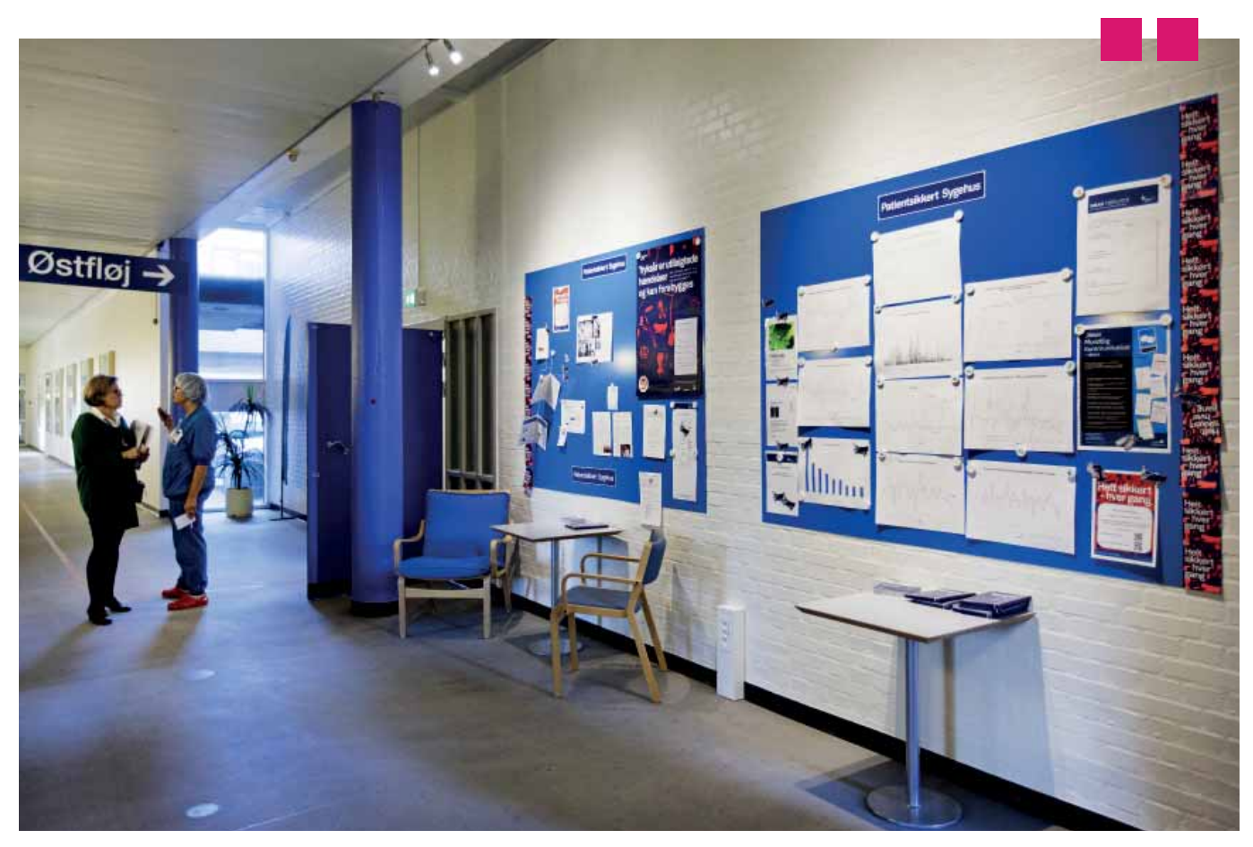
Visibility. At the Thisted Hospital, overall improvement data are presented on a big notice board accessible to the general public. Staff and patients can monitor the results of improvement work at the hospital as a whole. When the individual staff member can see that he or she contributes to improvements in the overall patient safety at the level of the whole organisation, the daily efforts make sense.

Sustaining improvement requires ongoing focus on this area. We have started up a major management model with management notice boards, management performance boards where we use Lean, focusing on quality and patient safety as elements. This model clearly shows if things are beginning to move in the wrong direction. We continue to "stay in touch with the good figures". Some elements we measure at slightly longer intervals, but where things are difficult, we meet weekly; in other areas, we only meet once a month. If something is going wrong, we address it, correct it, and sustain it. Some things are easier to address because they fit better into our culture.