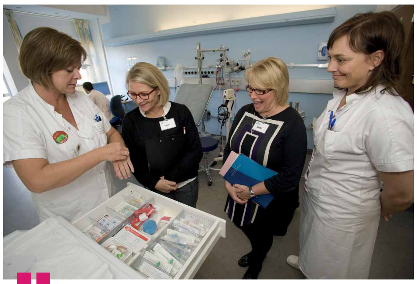
Hospitalsbesøg med Institute for Healthcare Improvement, IHI på Hillerød Hospital, 2011.

"I think discussions have changed fundamentally. We now discuss data and whether we will reach our goals in a much more qualified way. We look at whether we have improved — not in competition with others, but whether we have improved relative to our own starting point. It is possible to make improvements without getting anywhere close to the best, but still these improvements can be a great success. We call this "Close-to-the-clinic leadership": executives do patient safety rounds and spend much more time in departments. It is much more legitimate now to say that this is part of our leadership role. The distance between what we decide and what we see is much shorter.