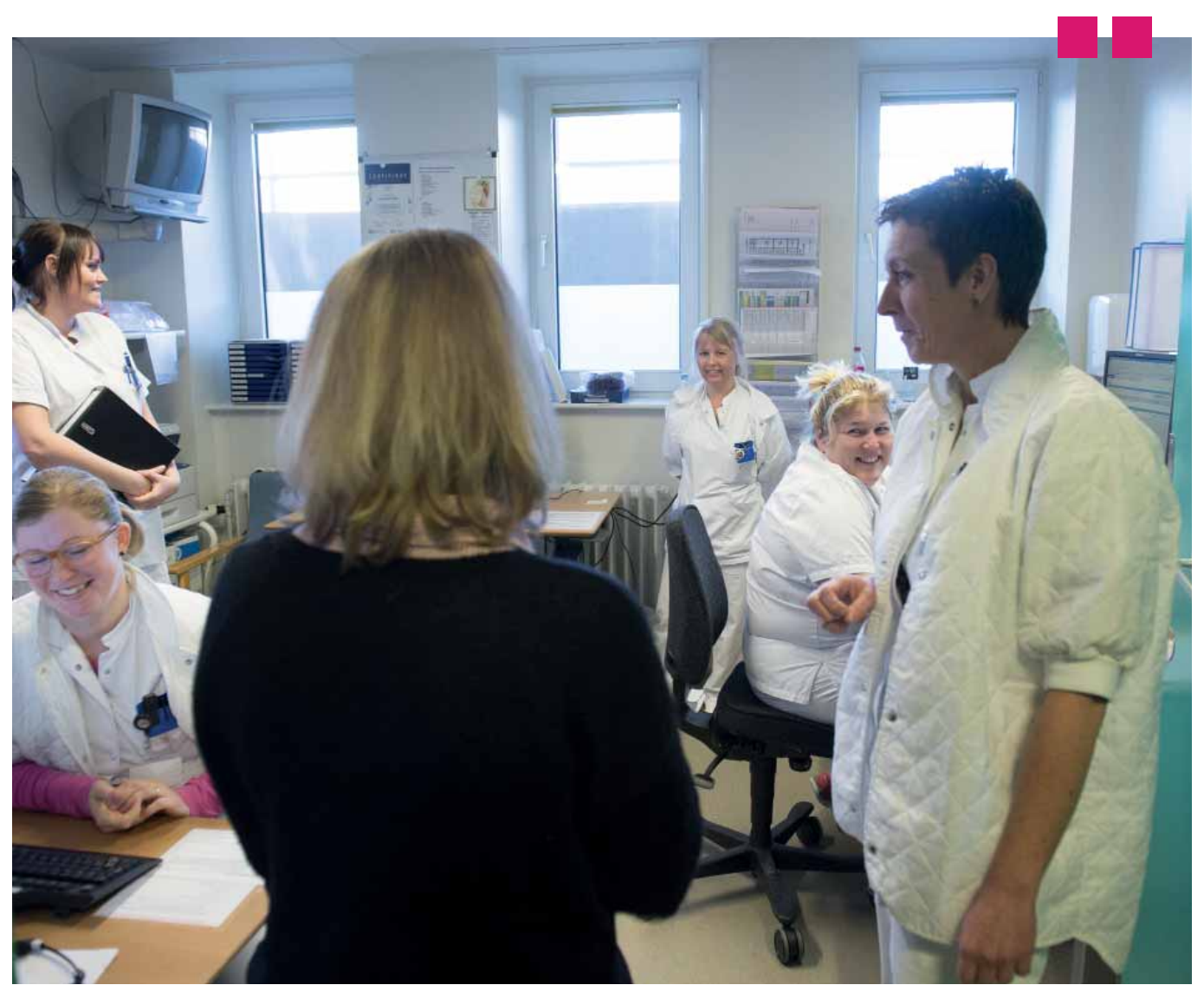
Site visit at Thisted Hospital, January 2013.

From a feature in Politiken (Danish national newspaper) by the five hospital managements