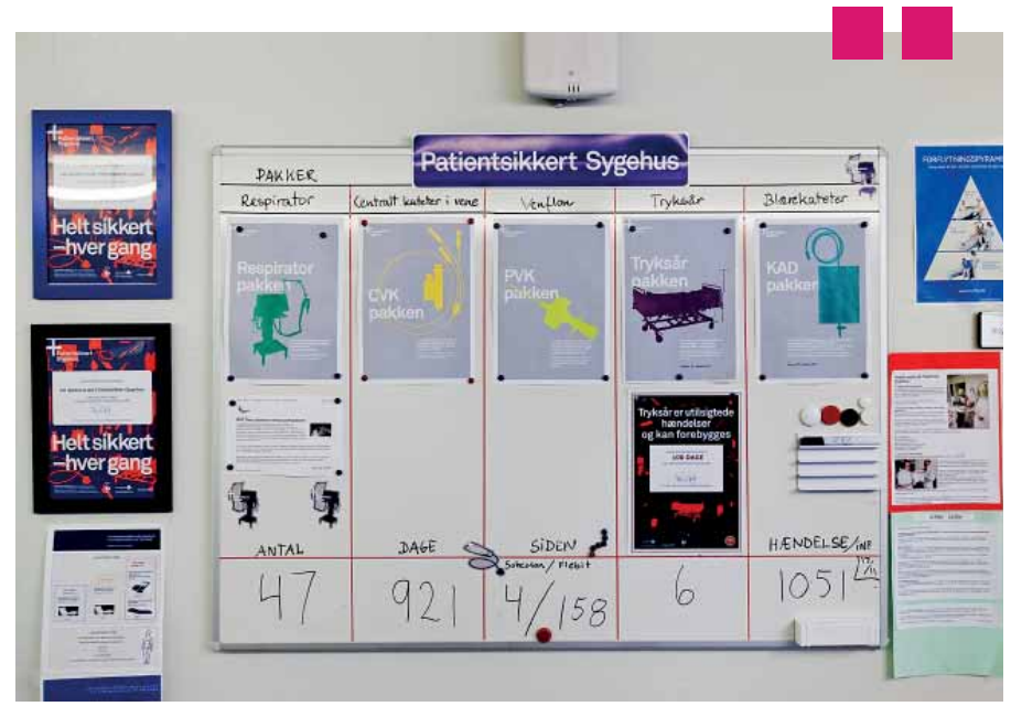
Visible patient safety. Example of a whiteboard with improvement data from the ICU at Næstved Hospital. The whiteboard is in the corridor and visible to visitors.

Secondly, focus group interviews in 2014 confirmed that visible data on