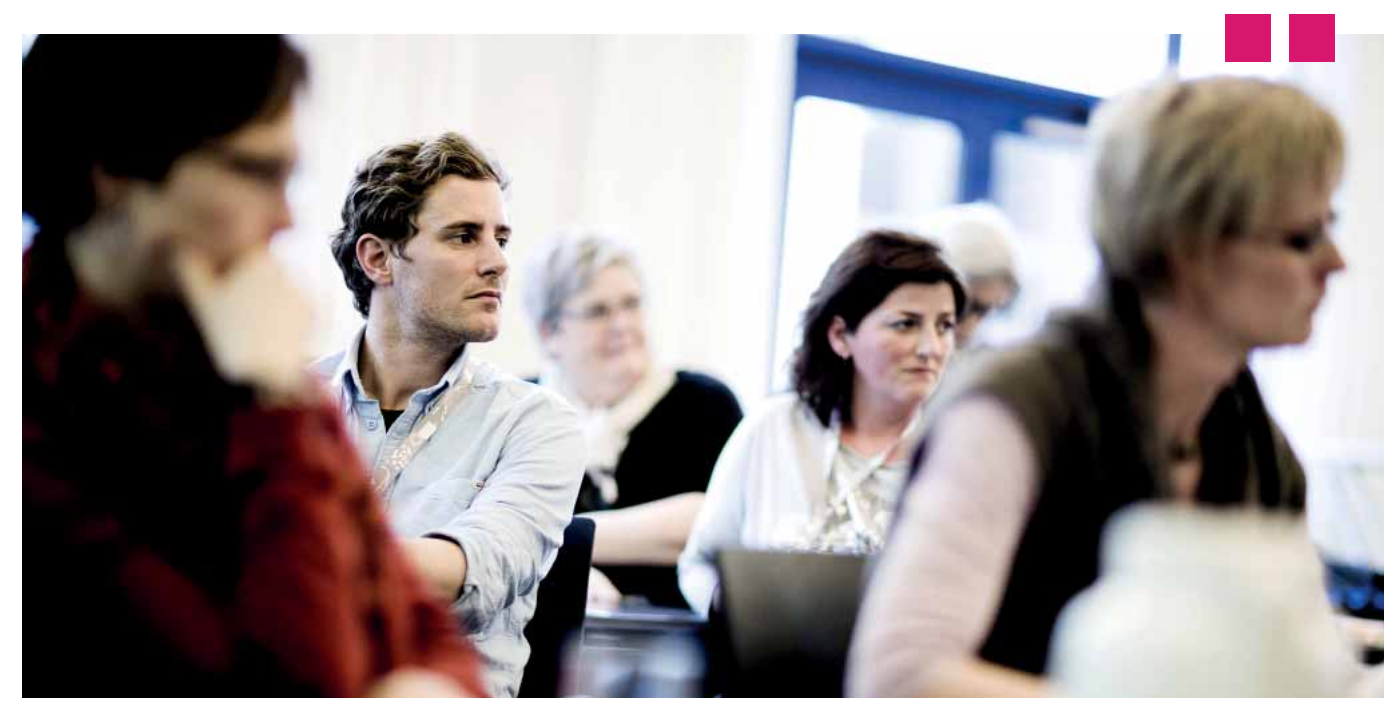
Learning seminar in Kolding, March 2012.

Experience from the Danish Safer Hospital Programme shows that local, real-time measurement of quality is an eye opener. As a health-care professional, you always want to do your best for the patients, and before you start looking at data, you are usually convinced that you deliver a high standard of care and patient safety. However, data might show that processes are not that safe after all. If you look at the share of patients who receive all elements